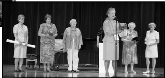
2006 Collegiate Performers