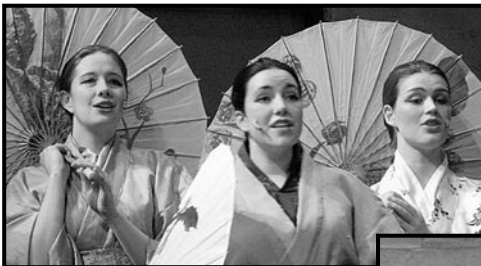
Pictures from Sinfonicron's 2007-2008 of The Mikado

Our fraternity is very proud of this project because it demonstrates the long heritage of cooperation between two music fraternities and the creative leadership that participation in a music fraternity develops. D.O. members can find out more about the project by googling "Sinfonicron" or http://web.wm.edu/so/sinfonicron/ .