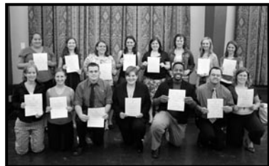
2006 Community Service Awards