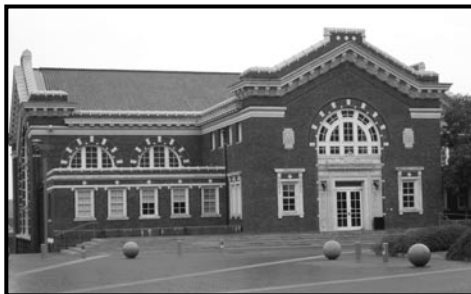
Cincinnati College Conservatory