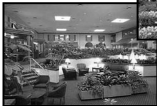
Holiday Inn Lobby