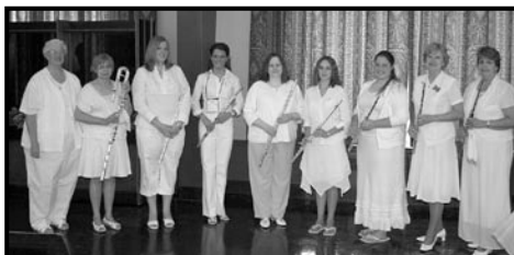
2006 Flute Choir