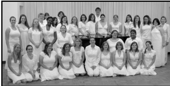
Xi Province Members

The culmination of the evening was the initiation of nine new Delta Omicron members. The initiation took place in the small chapel on campus, facing west, with the sun setting in a perfect position for the initiation.